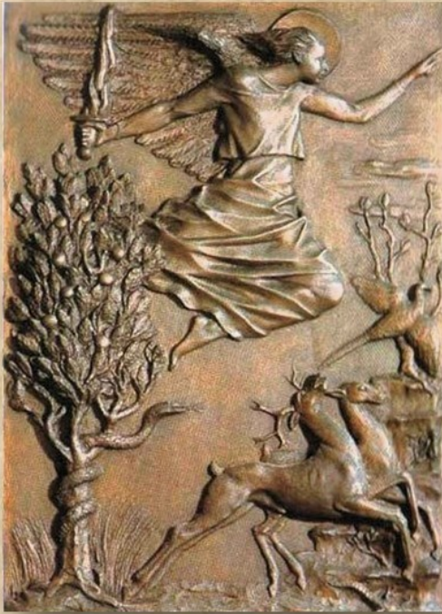
The Angel at the Gates of Paradise

The Holy Doors are composed of 16 panels that includes scenes from biblical history and includes a scene of opening the Holy Door. The photos below display the first panels of the Holy Doors with their explanations and translation of the Latin inscriptions.