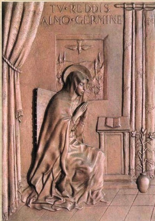
The Annunciation - "Tu Reddis Aimo Germine" (Your Sacred Womb Restores)

"Quod Heva Tristis Abstulit" (What Eve had lost)