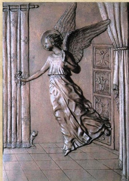
The Angel of the Annunciation