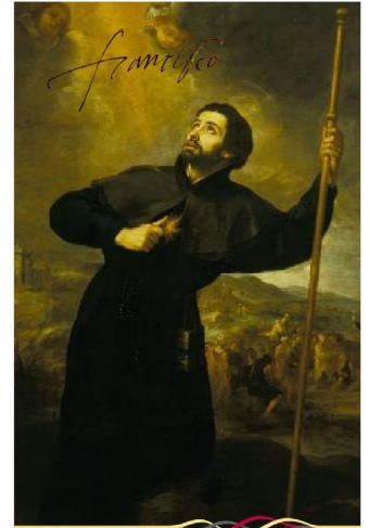
Praying with Saint Francis Xavier The Novena of Grace

God our Father, as St Francis Xavier travelled to the ends of the earth, impelled by love of Christ and afire with his good news, give me the trust and the grace to base all that I do entirely on you, safe in the knowledge that you raise up the lowly and fill them with good things. Through Christ our Lord. Amen.