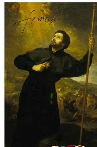
Praying with Saint Francis Xavier The Novena of Grace

God our Father, as St Francis Xavier travelled to the ends of the earth, impelled by love of Christ and afire with his good news, give me the trust and the grace to base all that I do entirely on you, safe in the knowledge that you raise up the lowly and fill them with good things. Through Christ our Lord. Amen.